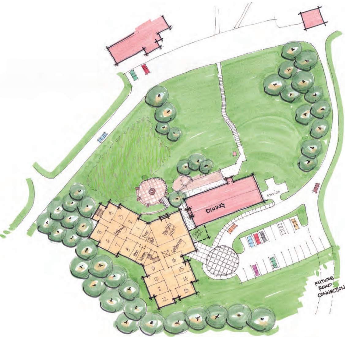
Site Plan / Main Level Floor Plan